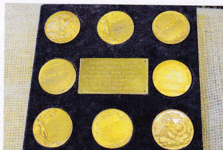
8 Lord Derby Gold Medals